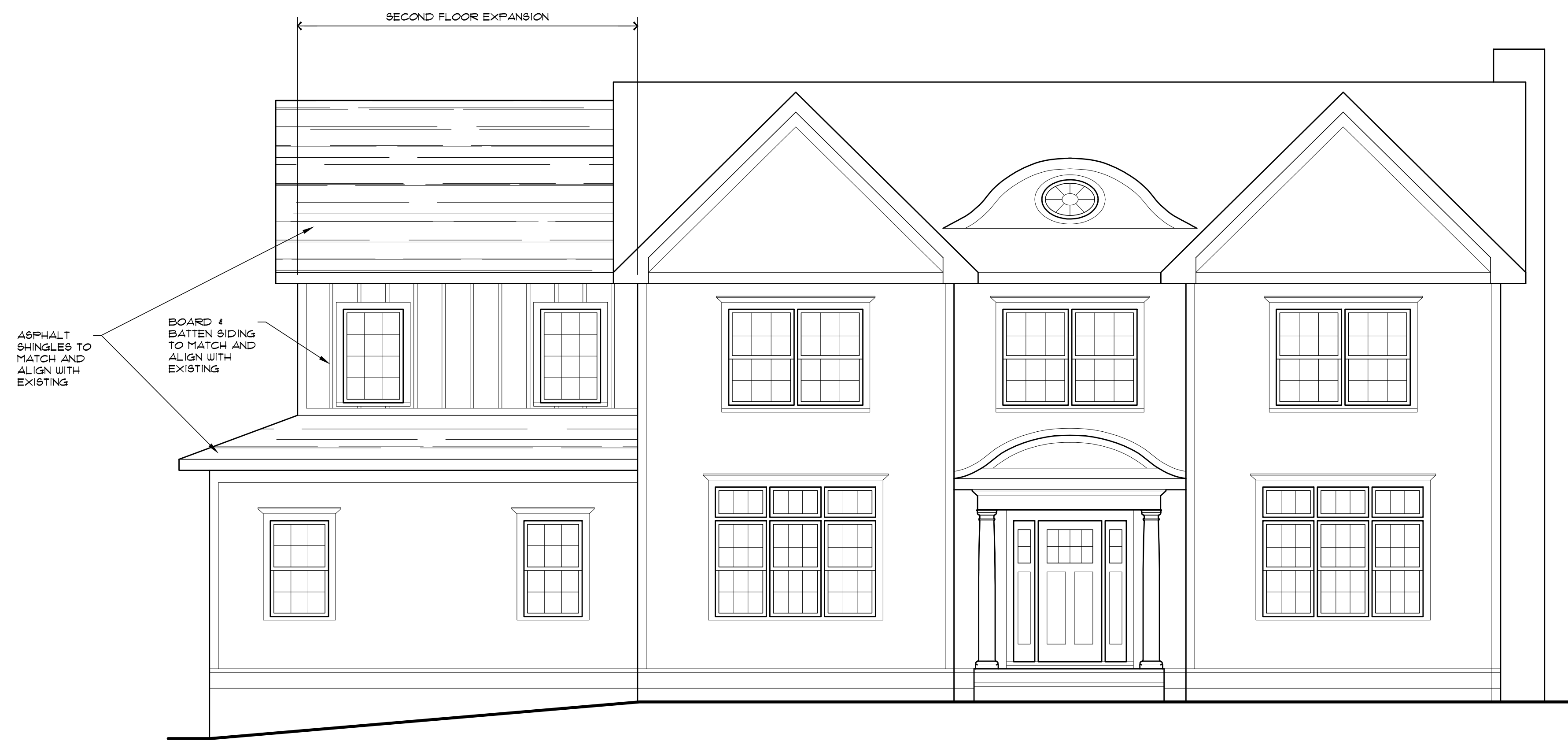
EL-1 FRONT ELEVATION SCALE: 1/4" = 1'-0" EXISTING