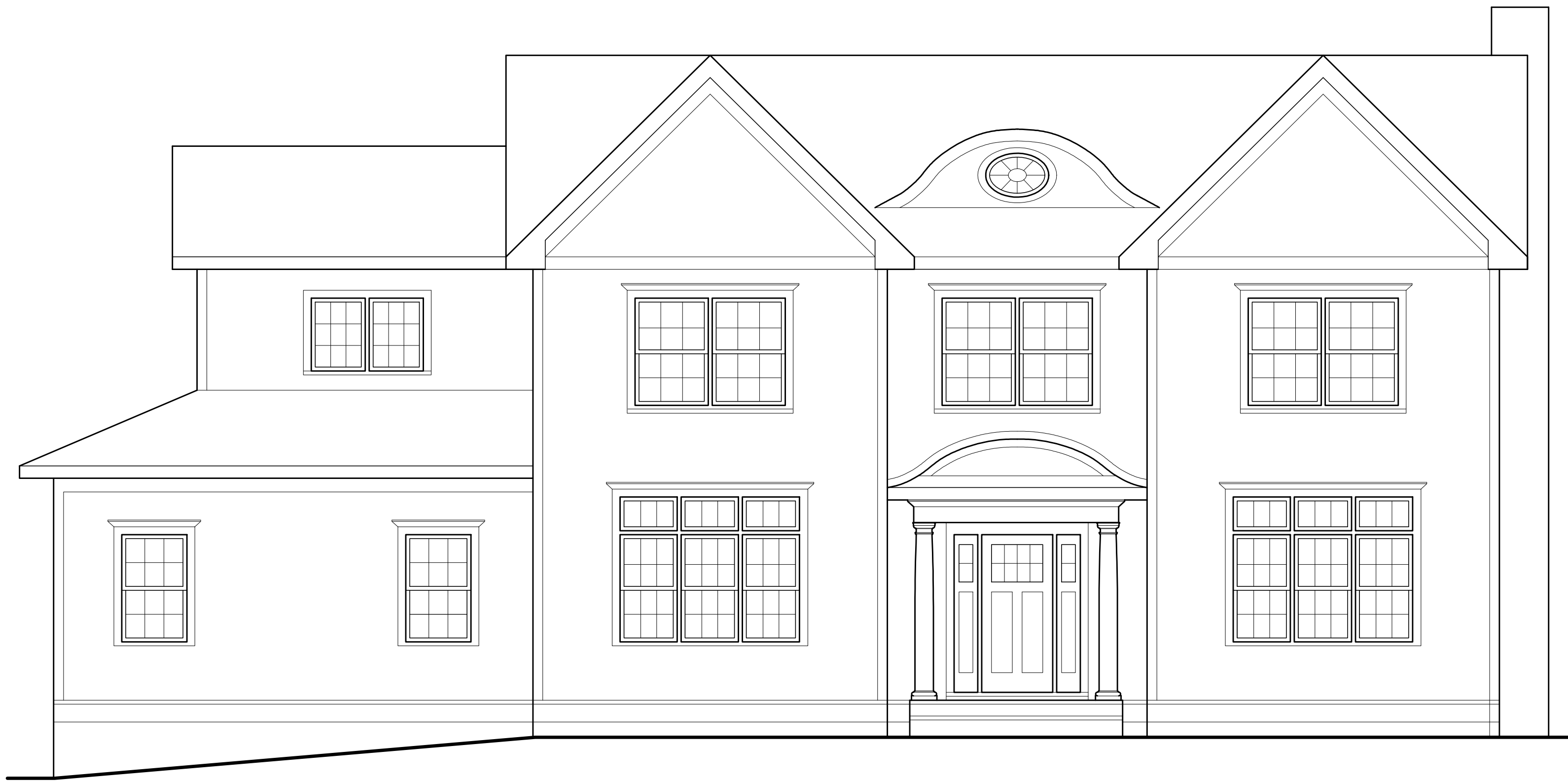
EL-1 FRONT ELEVATION SCALE: 1/4" = 1'-0" EXISTING