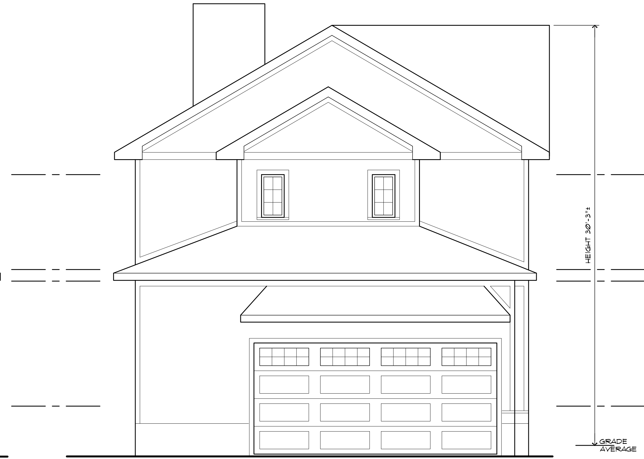
EL-2 SIDE ELEVATION SCALE: 1/4" = 1'-0" EXISTING