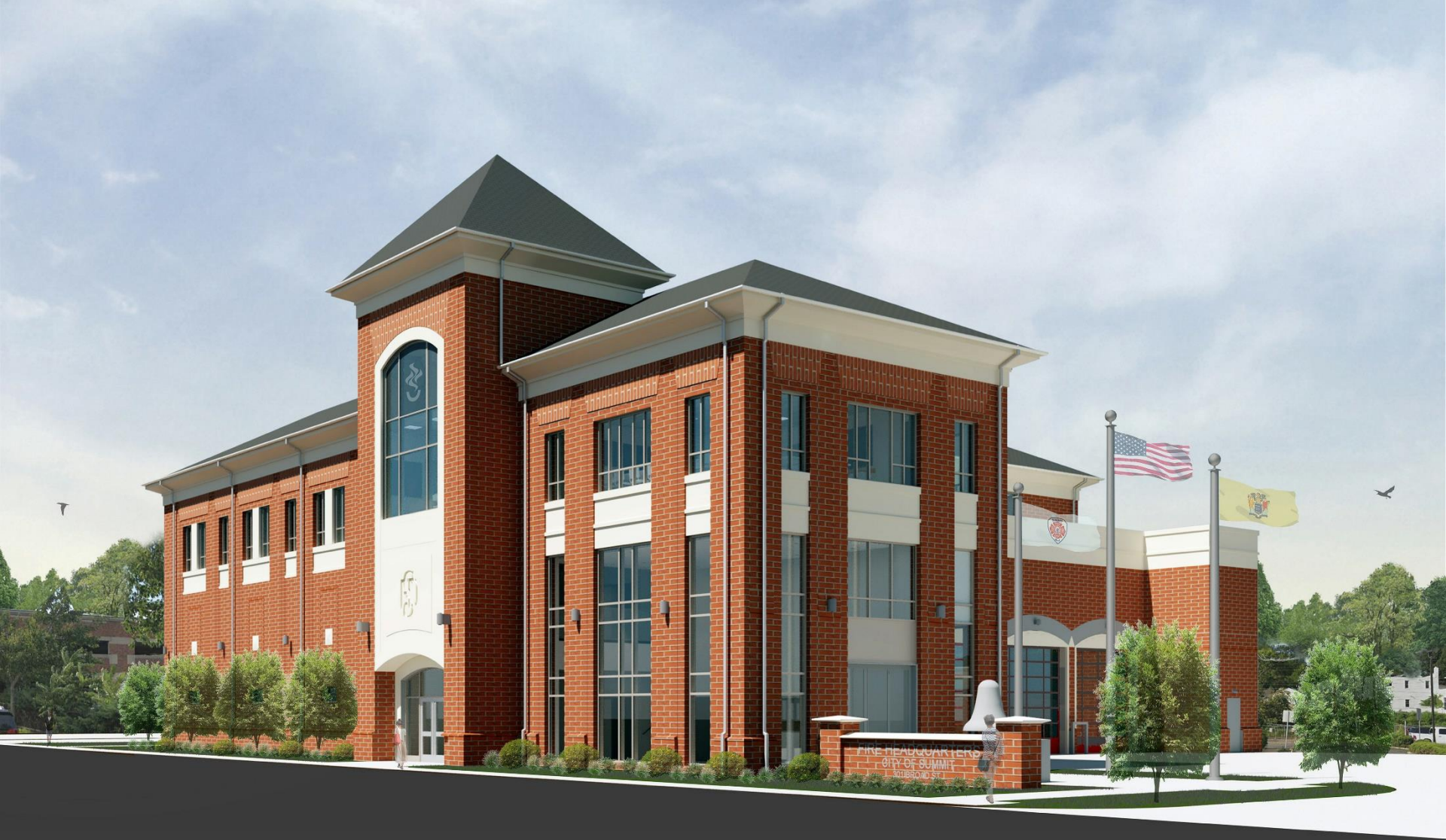
CITY OF SUMMIT FIRE HEADQUARTERS EXTERIOR PERSPECTIVE VIEW - BROAD STREET ENTRANCE