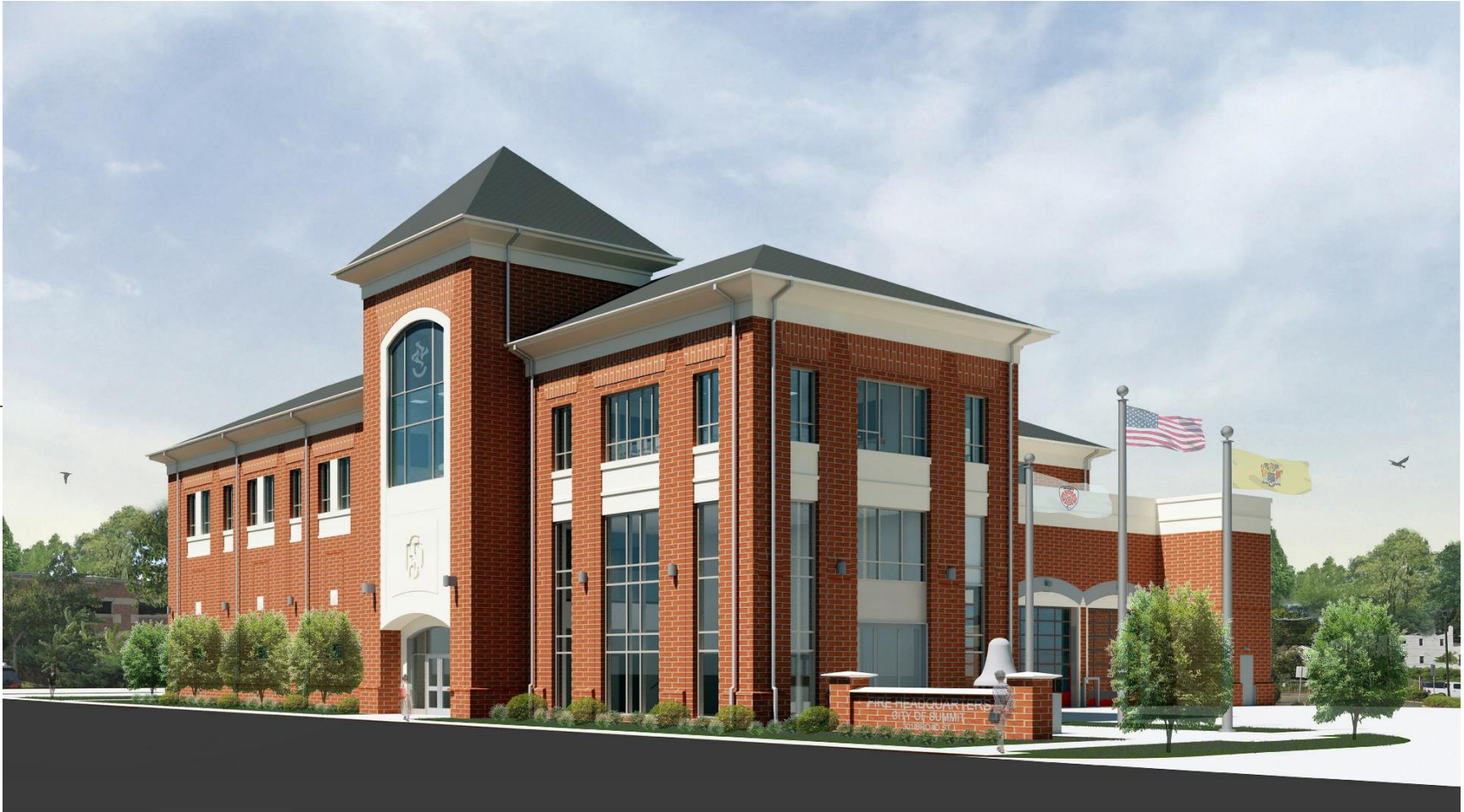
CITY OF SUMMIT FIRE HEADQUARTERS EXTERIOR PERSPECTIVE VIEW - BROAD STREET ENTRANCE