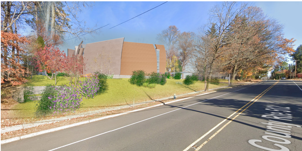
GOOGLE STREET VIEW PHOTOS + 3D RENDERINGS OF PROPOSED DESIGN